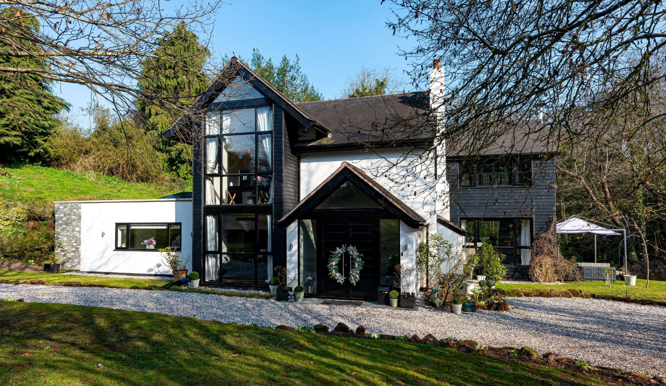
Old Mill House, 11 Holyhead Road, Cosford, Shifnal, TF11 9JB