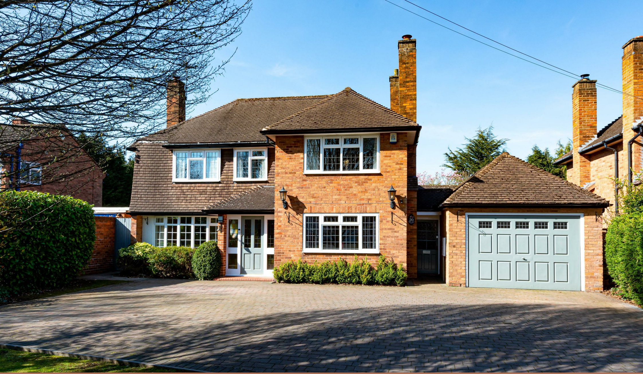
Coniston House, 20 Suckling Green Lane, Codsall, Wolverhampton, WV8 2BL