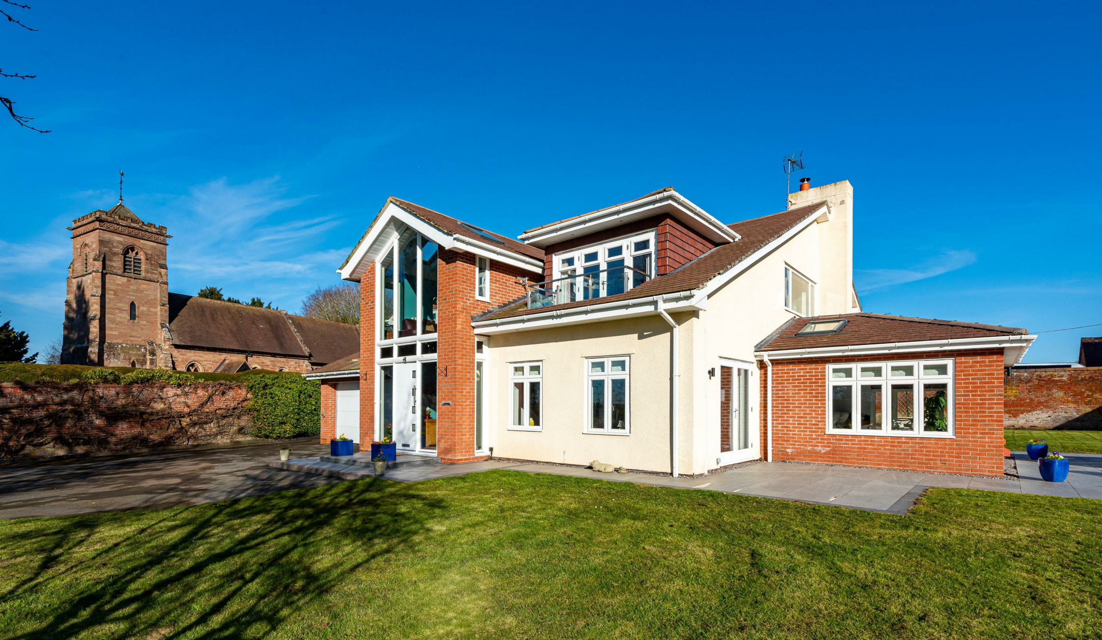
St Cuthberts House, Rectory Road, Albrighton, Wolverhampton, WV7 3EP