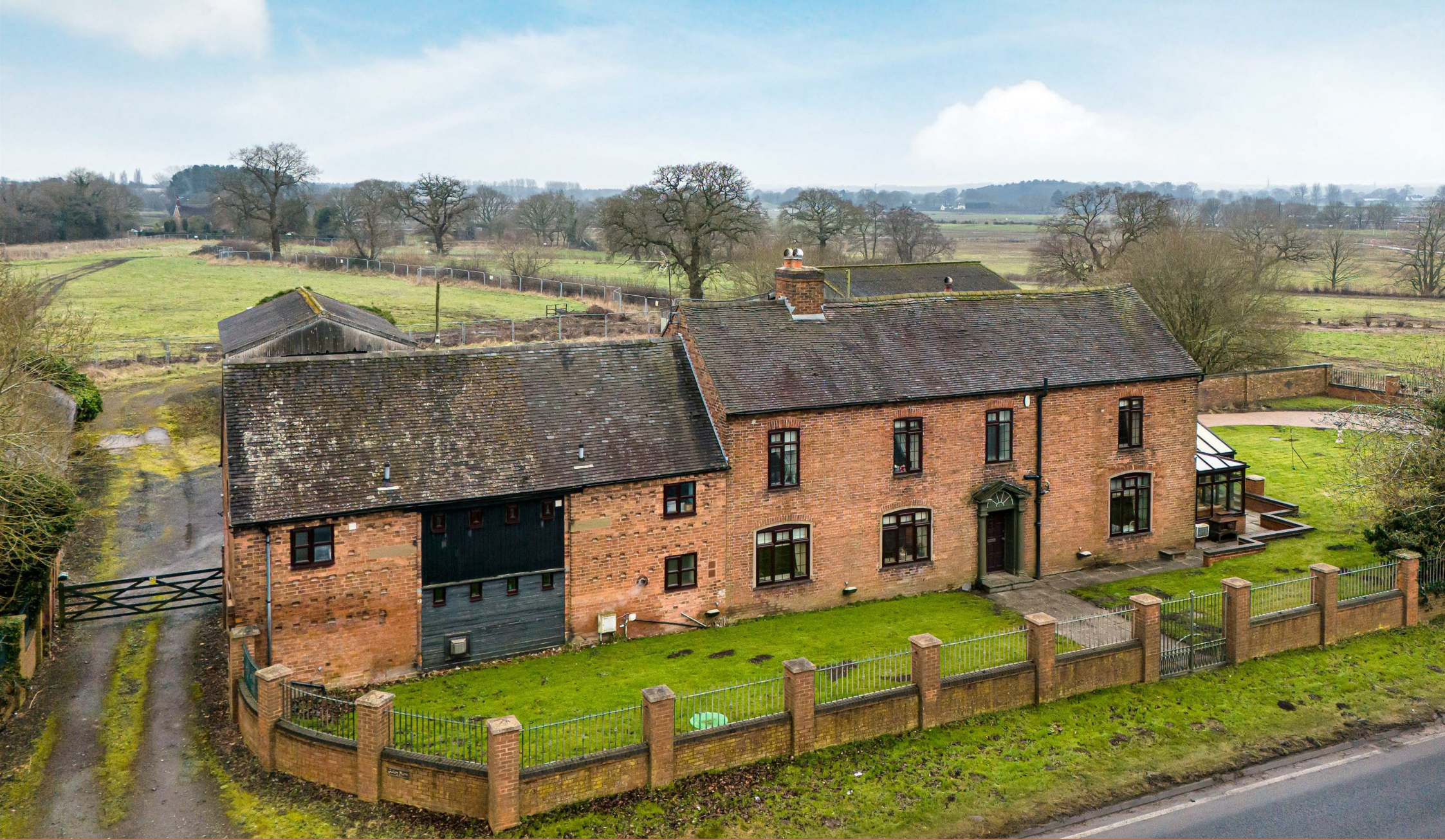
Hammerton House, Gailey Farm, Watling Street, Gailey, Stafford, ST19 5PR