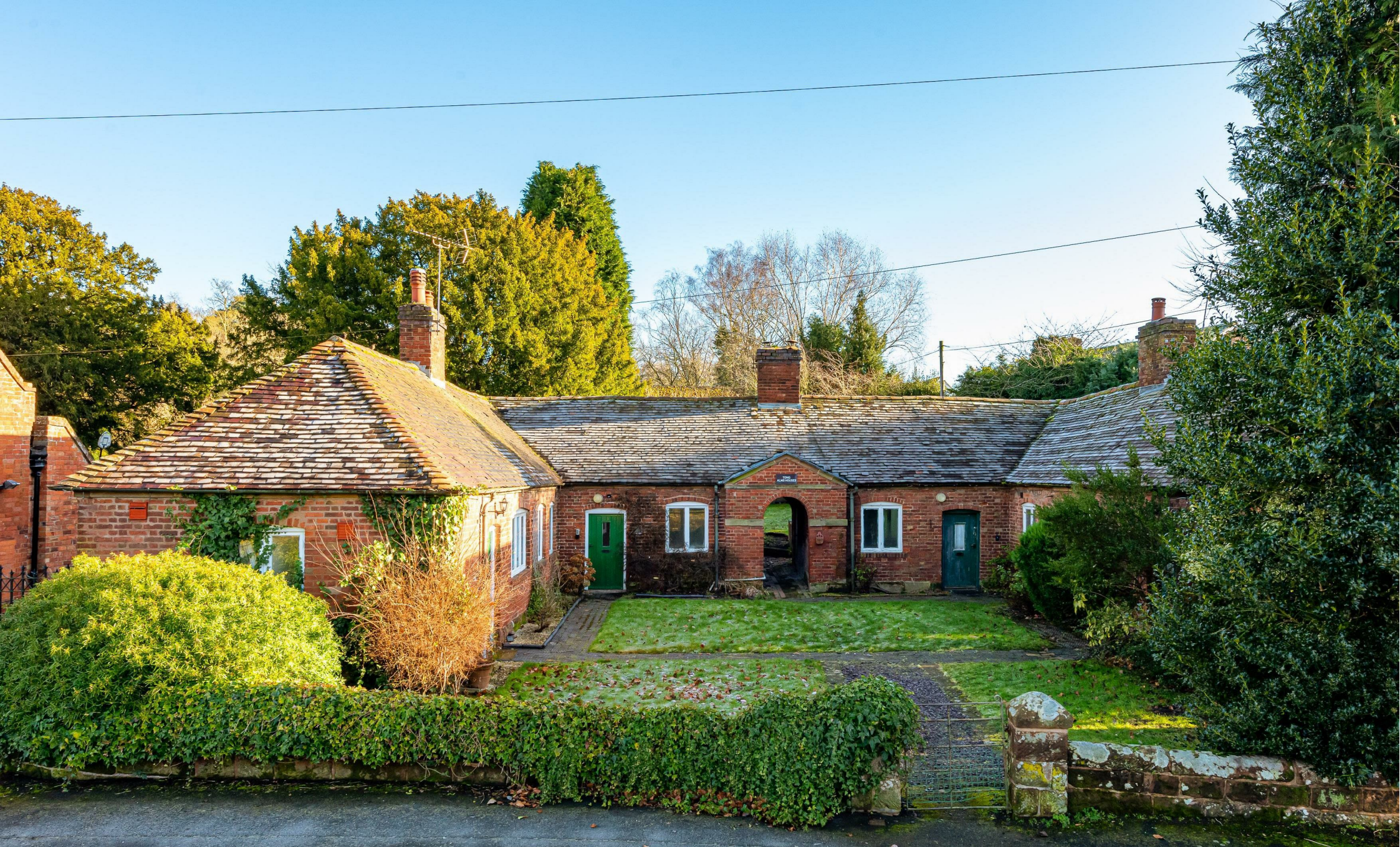
1-4 Almshouses Tong Village, Shifnal, TF11 8PP