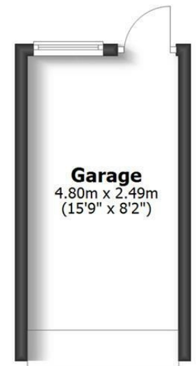
Garage 4.80m x 2.49m (15'9" x 8'2")