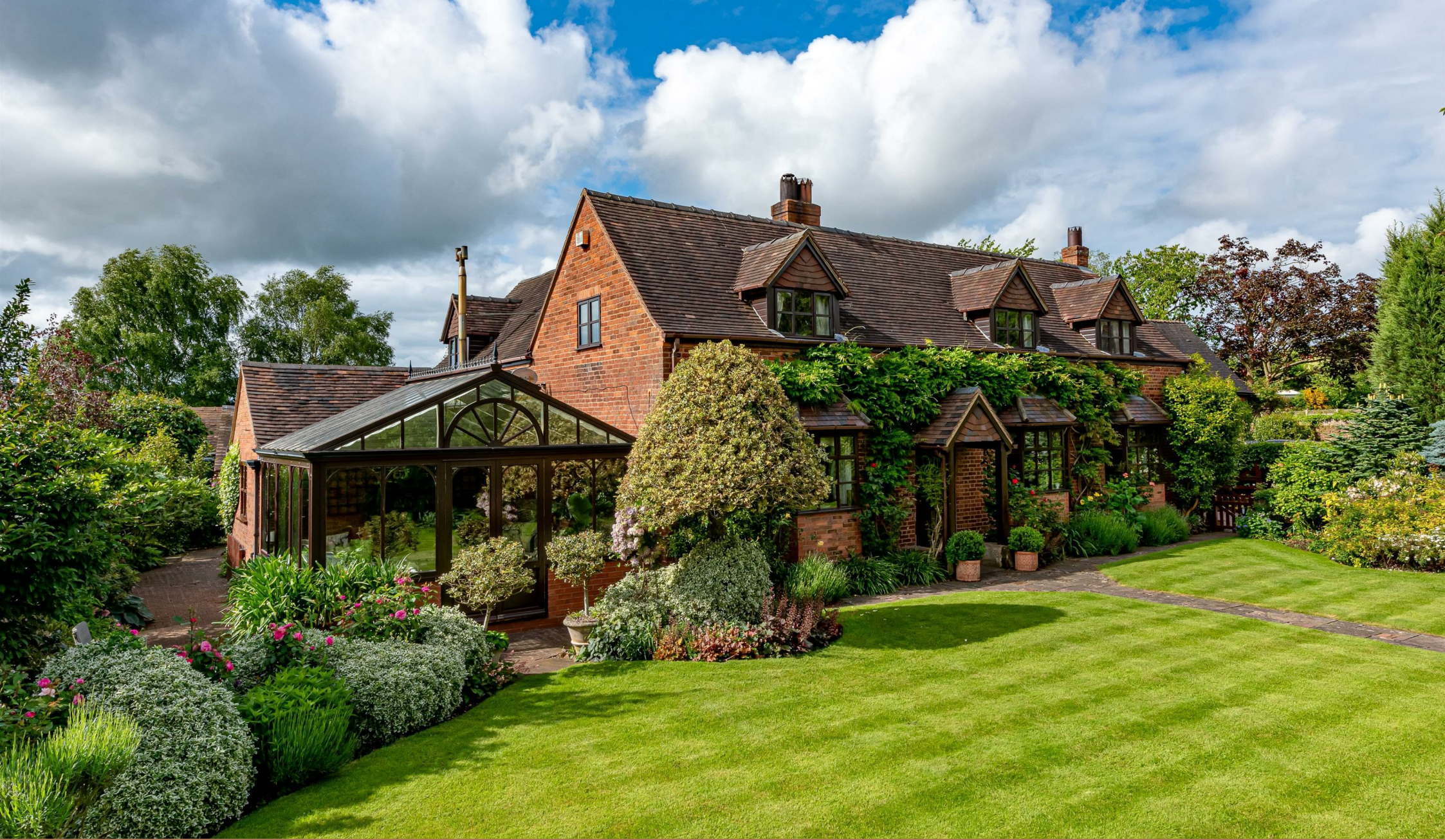
Middle Farmhouse, Church Lane, Sheriffhales, Shifnal, TF11 8RD