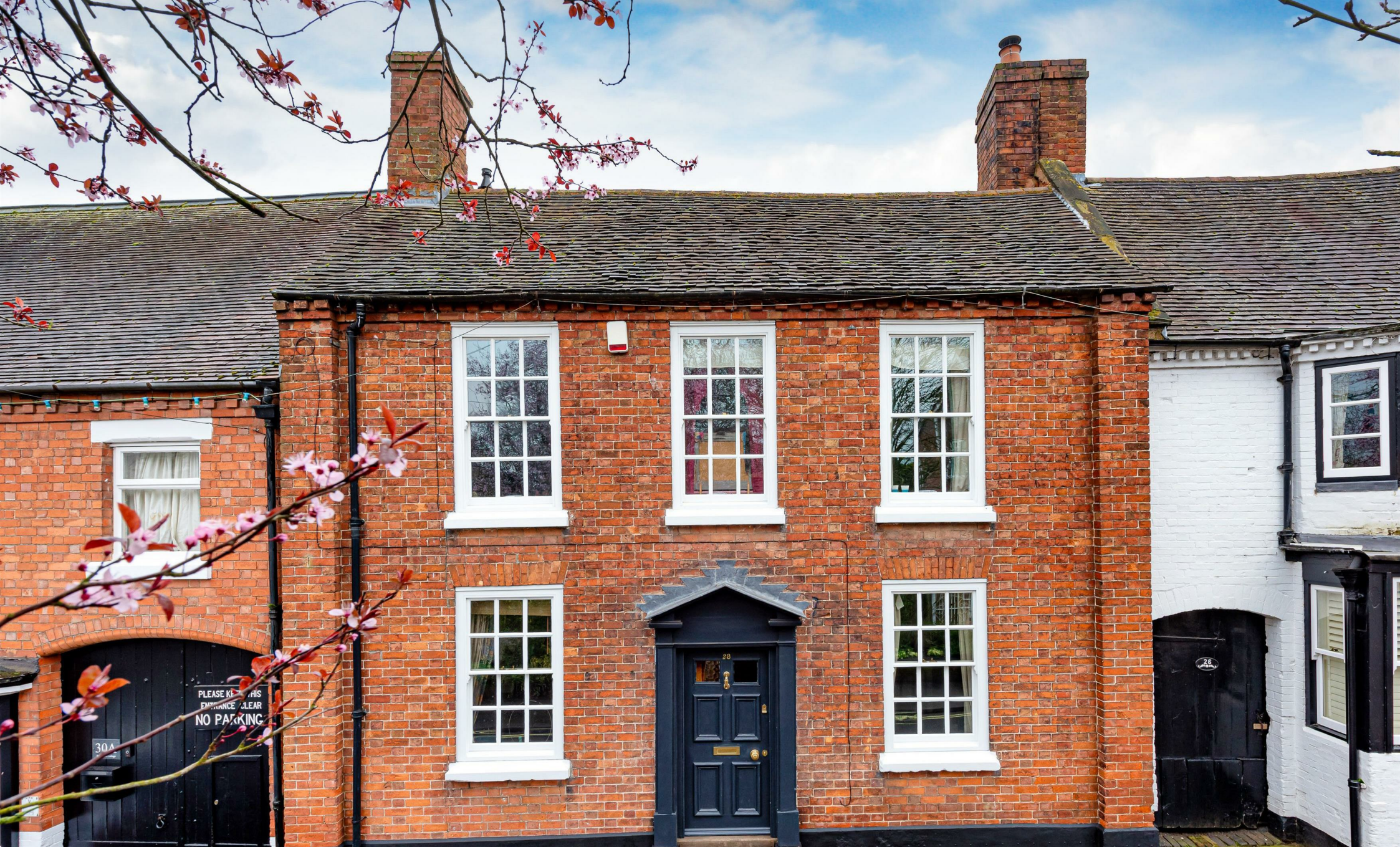
Saredon House, 28 Stafford Street, Brewwood, Stafford, ST19 9DX