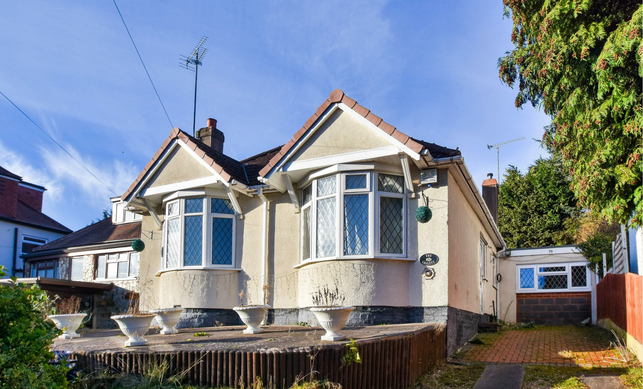
The Chalett, 78 Bridgnorth Road, Compton, Wolverhampton, WV6 8AG