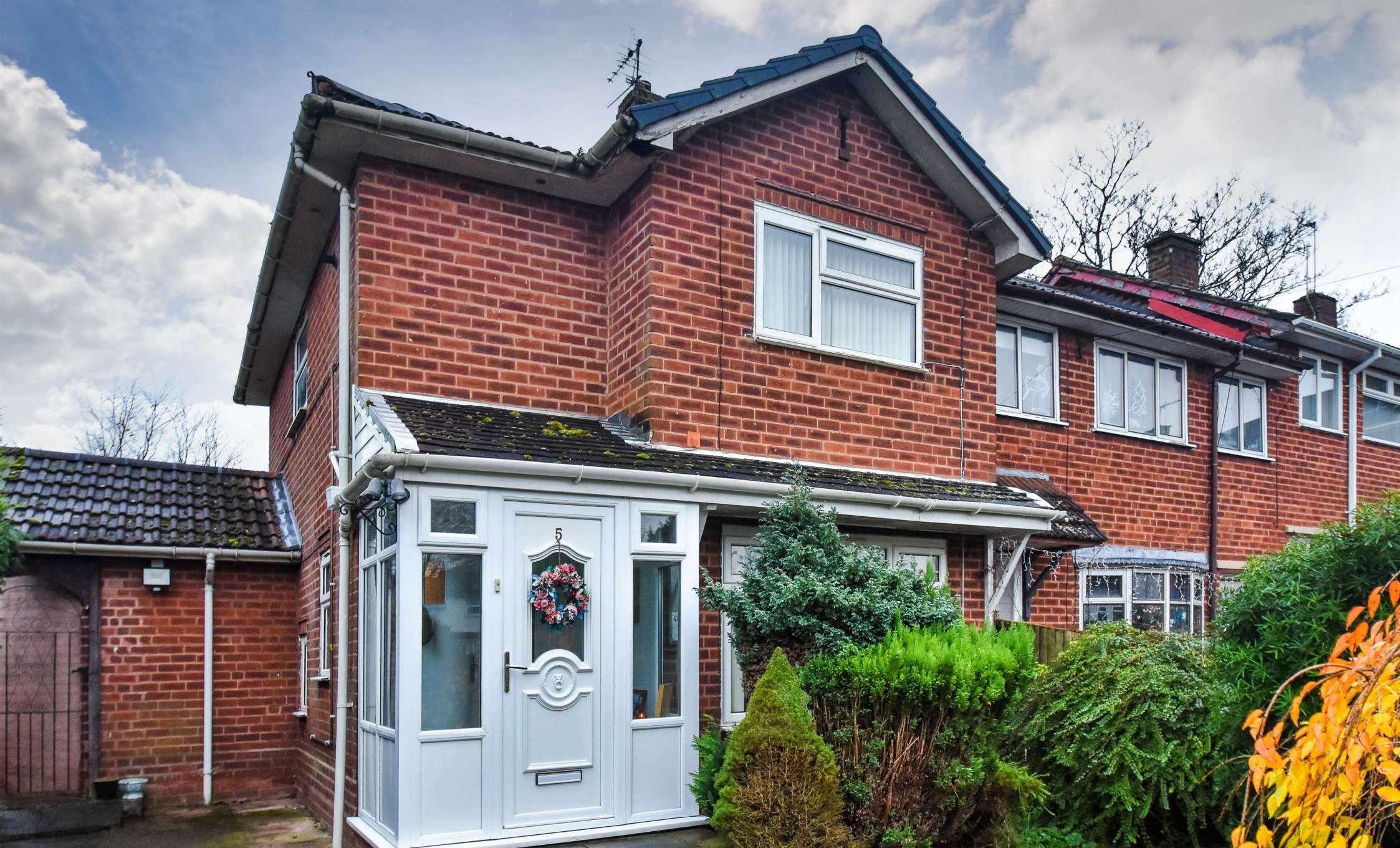
5 Manor Close, Codsall, Wolverhampton, WV8 1NF