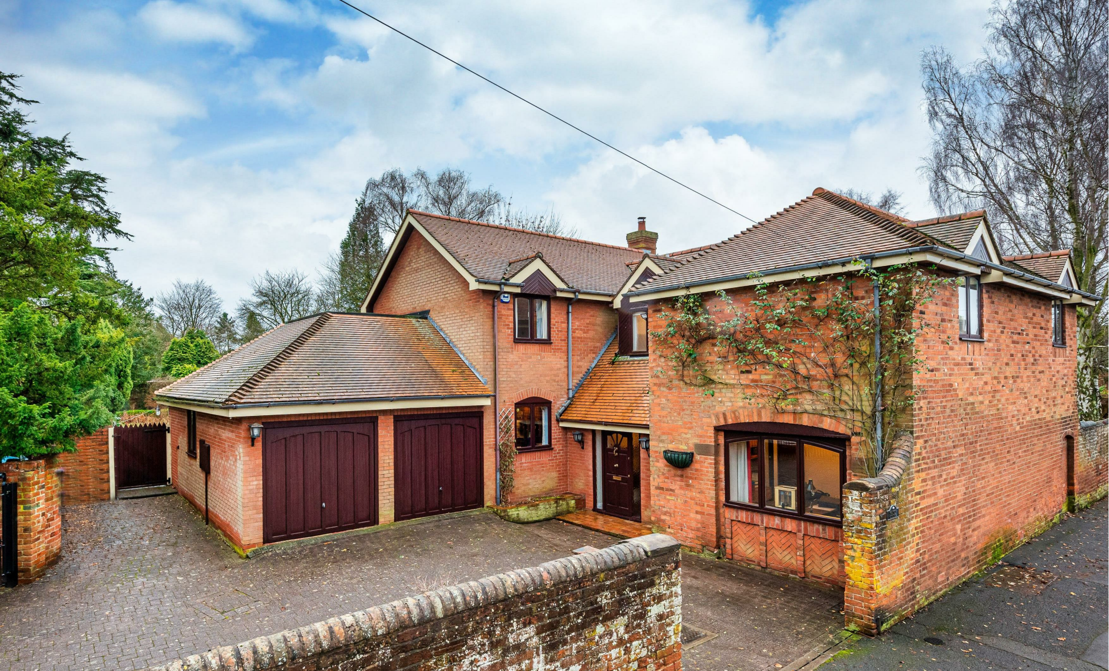
Manor Court, Cross Road, Albrighton, Wolverhampton, WV7 3BJ