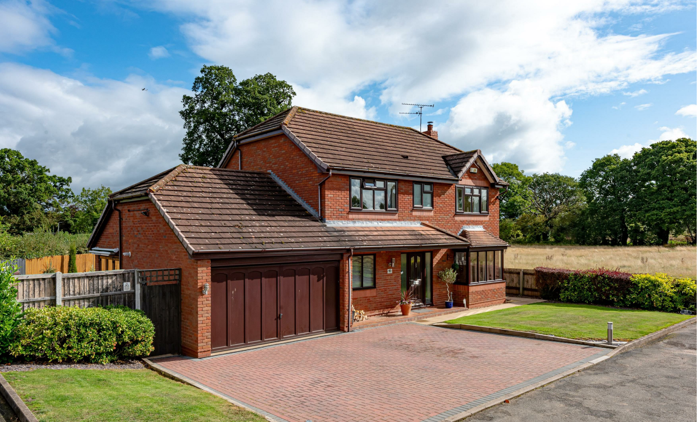
The Field House, 103 Six Ashes Road, Bobbington, Stourbridge, Staffordshire, DY7 5EA