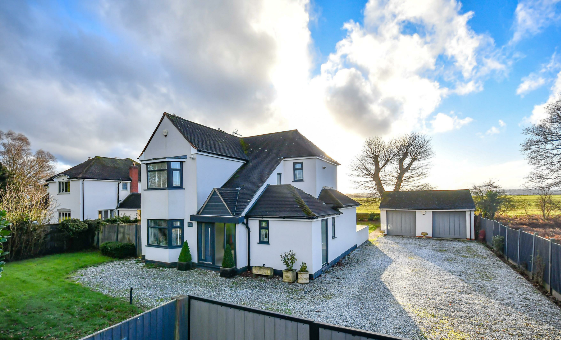
The School House, Gospel Ash Road, Bobbington, Stourbridge, West Midlands, DY7 5EF