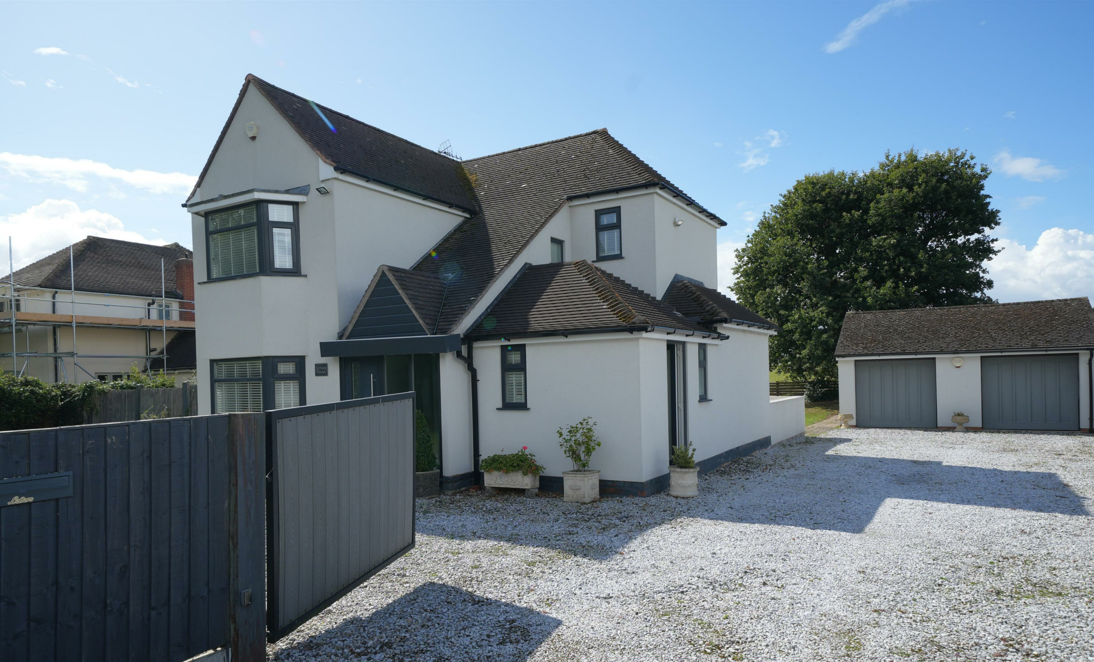
The School House, Gospel Ash Road, Bobbington, Stourbridge, West Midlands, DY7 5EF