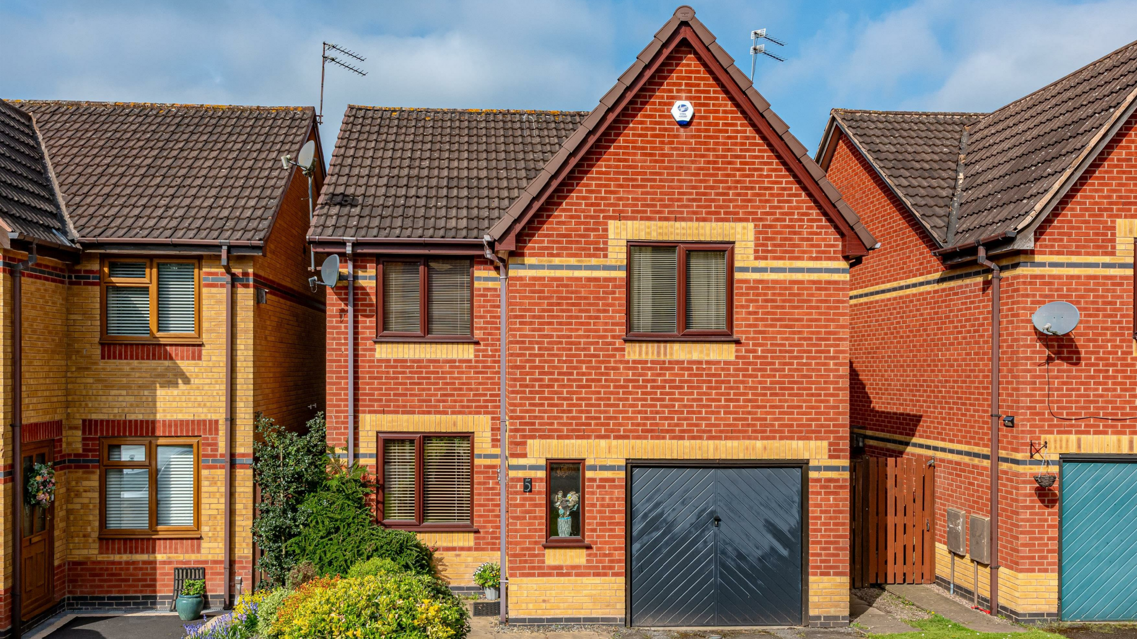
5 Bumblehole Meadows, Wombourne, Wolverhampton, WV5 8BG