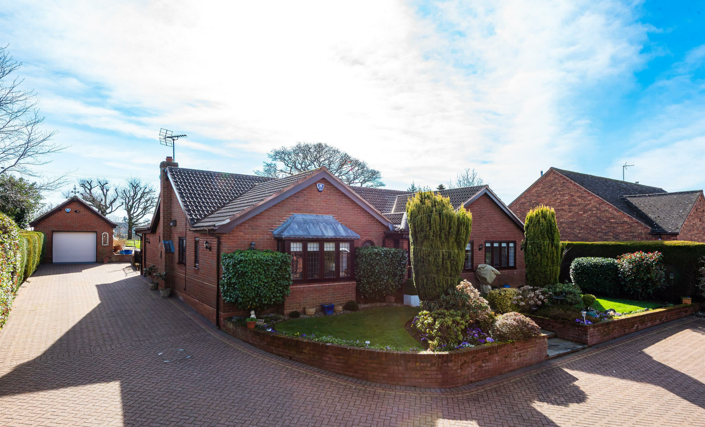
Tinkers Croft Tinkers Castle Road, Seisdon, Wolverhampton, Staffordshire, WV5 7HF