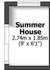
Summer House 2.74m x 1.85m (9' x 6'1")

HOUSE: 118.1sq.m. 1271sq.ft. STORE ROOM: 7.5sq.m. 81sq.ft. SUMMER HOUSE: 5.1sq.m. 55sq.ft. TOTAL: 130.7sq.m. 1407sq.ft.