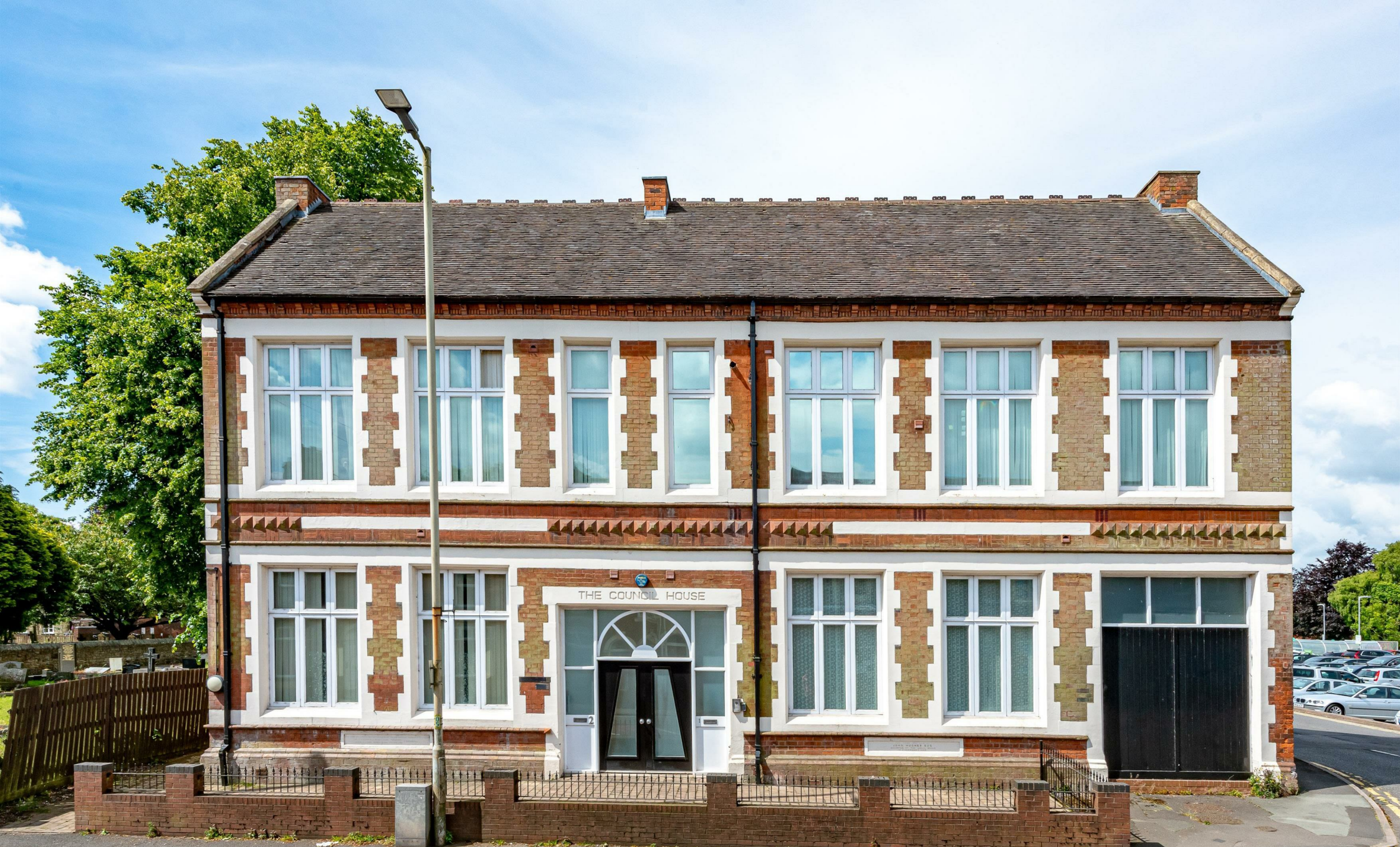
12 Holborn House, High Holborn, Dudley, DY3 1SP