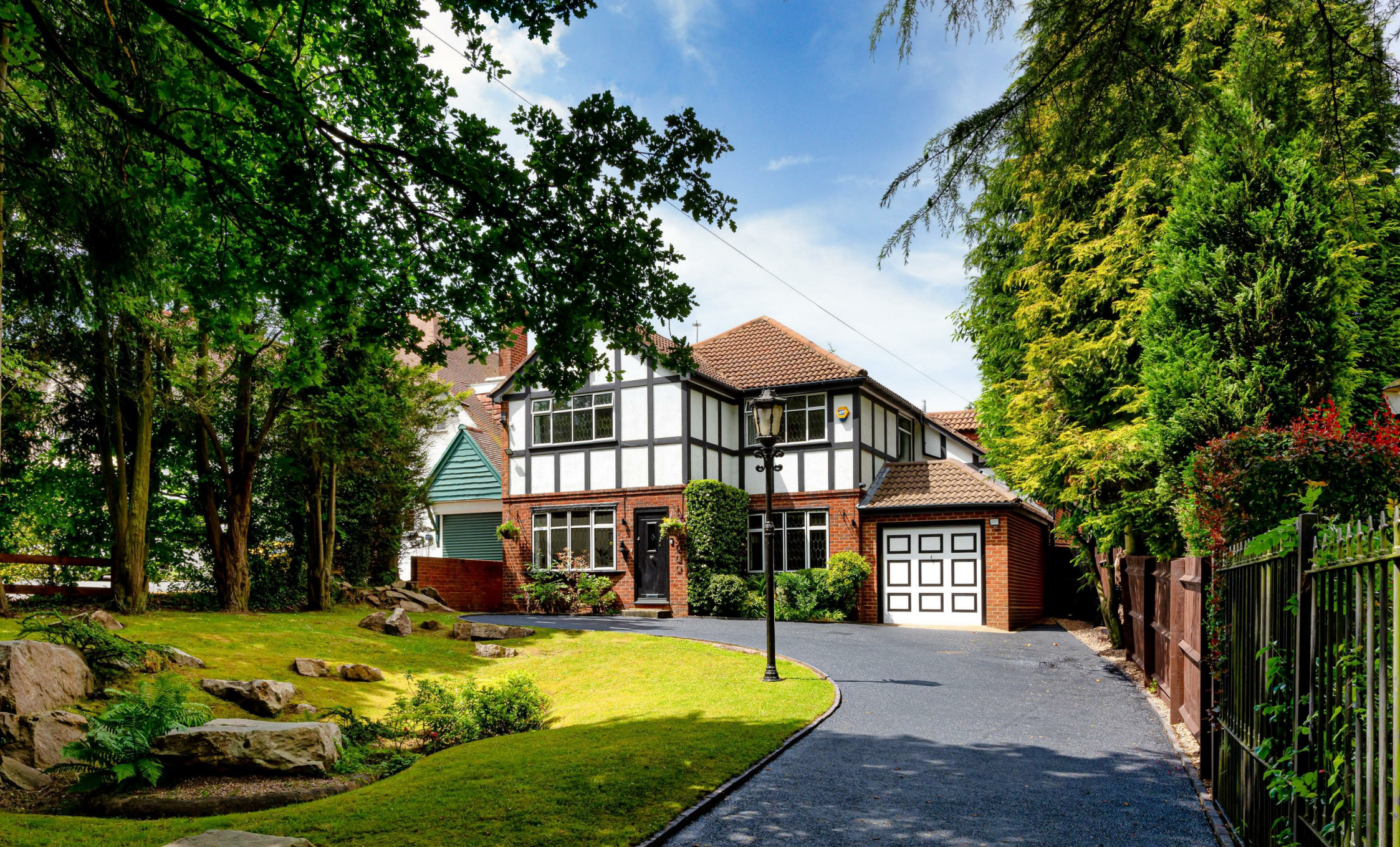
The Squirrels, 27 Stourbridge Road, Wombourne, Wolverhampton, WV5 9BN