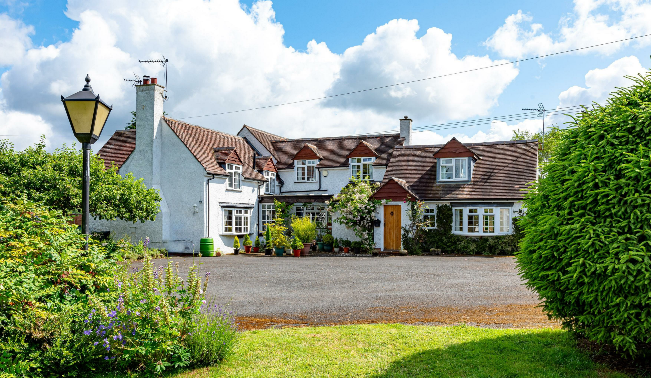
Rose Cottage, Plantation Lane, Himley, Dudley, DY3 4LL