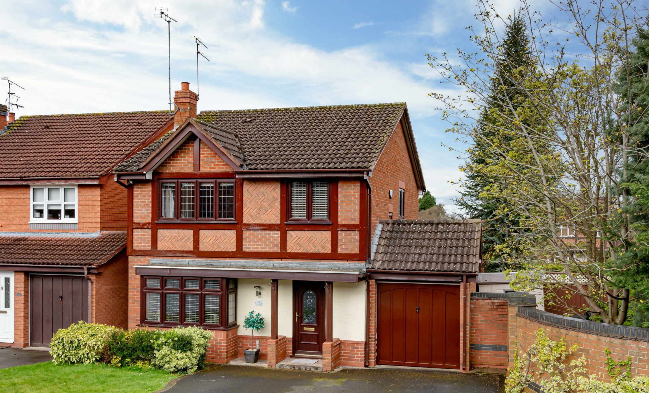
19 Penleigh Gardens, Wombourne, Wolverhampton, WV5 8EJ