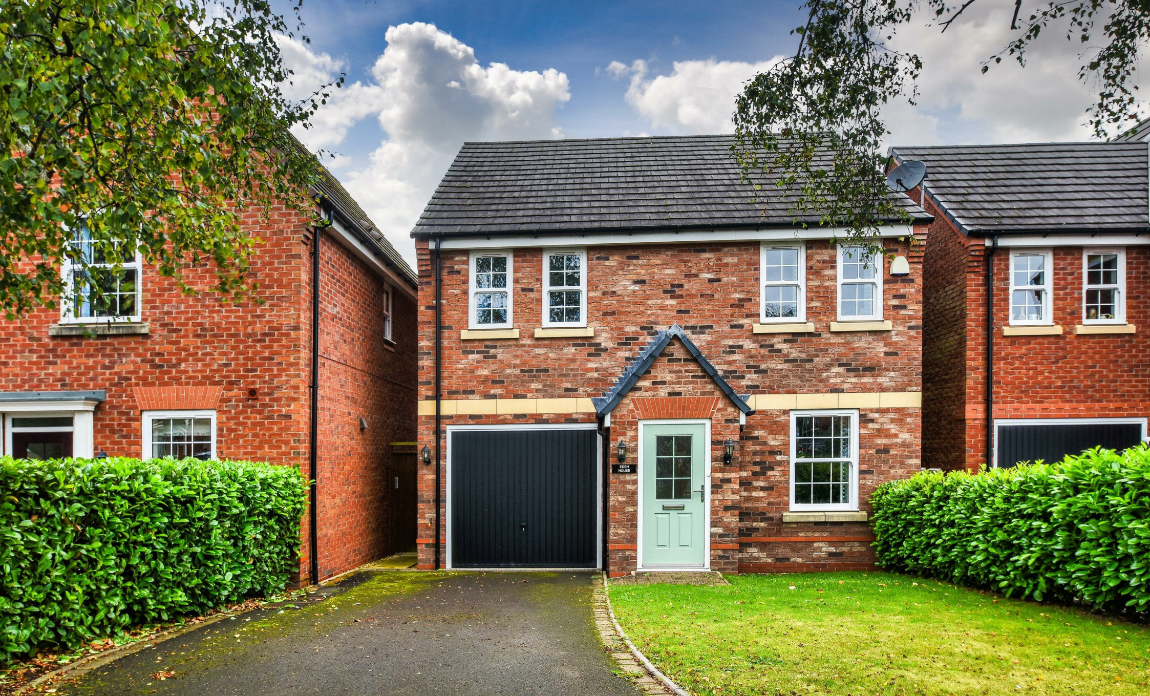
Eden House Wombourne Road, Swindon, Dudley, DY3 4NF