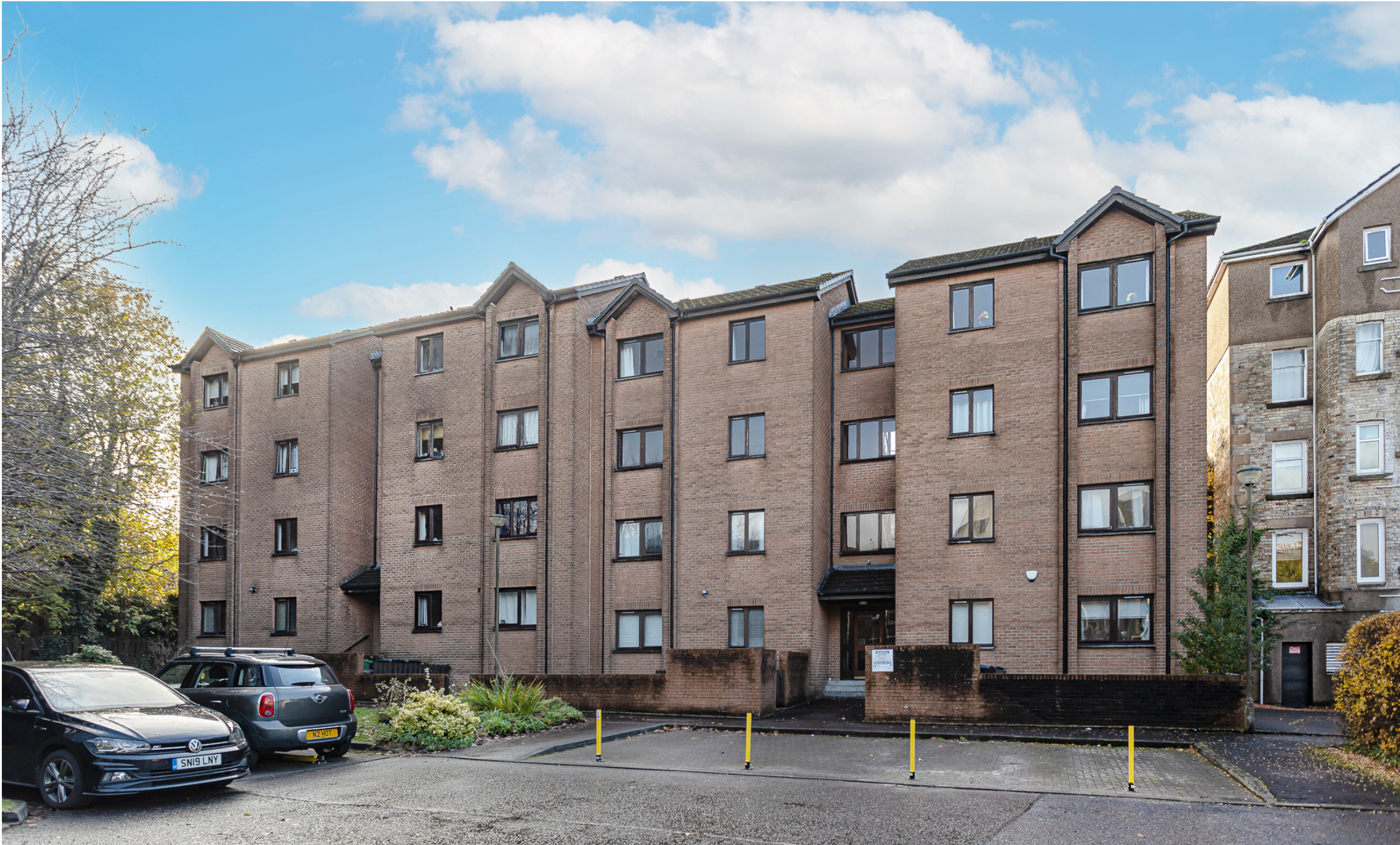
FLAT 17, WALLACE COURT, STIRLING, FK8 1NS OFFER OVER £124,500