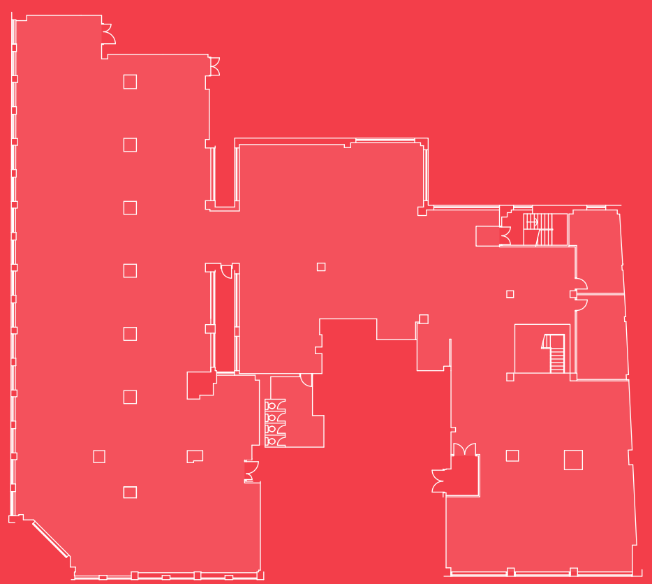
Ground Floor: 11,870 sq ft / 1,103 sq m