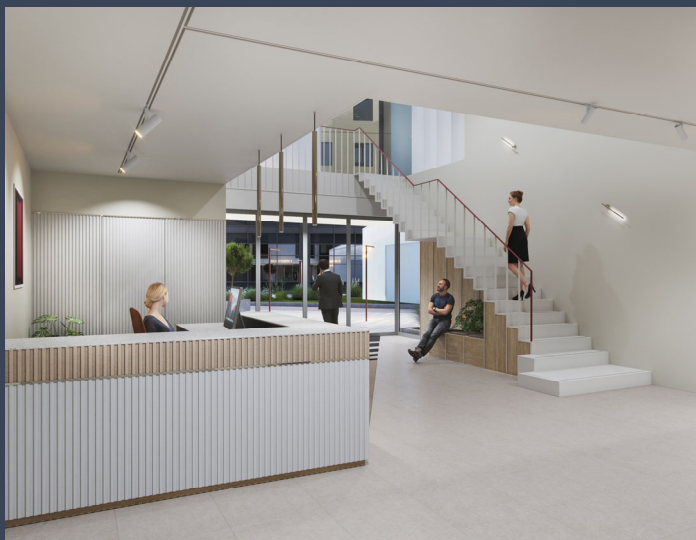
Proposed Reception Works