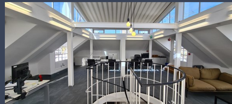
7th (top) Floor