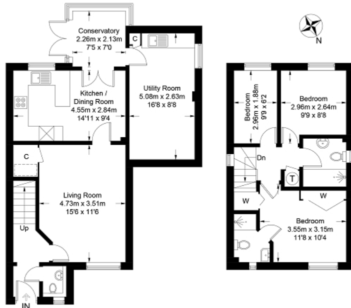
Ground Floor 58.1 sq m / 625 sq ft