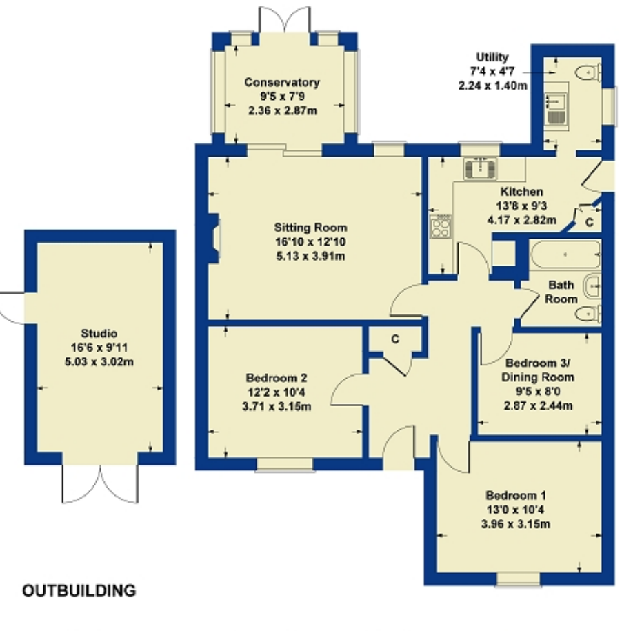
Approximate Gross Internal Area 1133 sg ft - 105 sg m