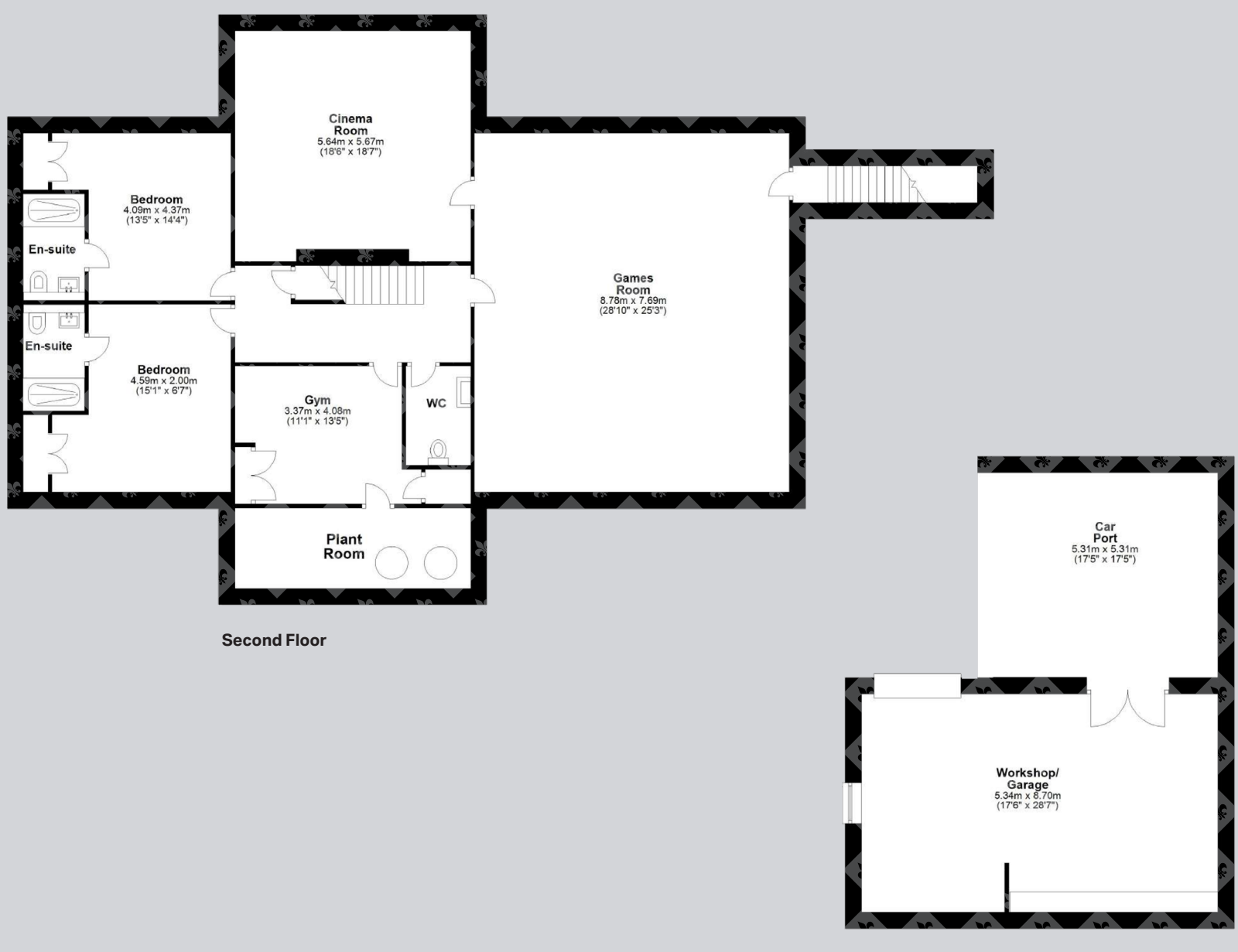
Ground Floor Garage