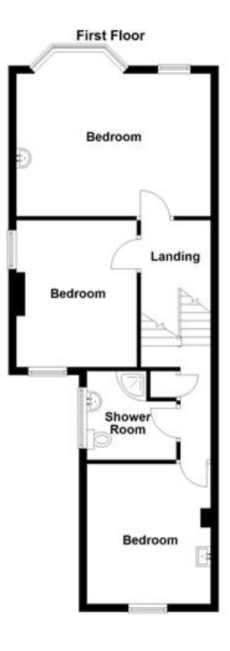
Total area: approx. 123.9 sq. metres (1334.1 sq. feet)