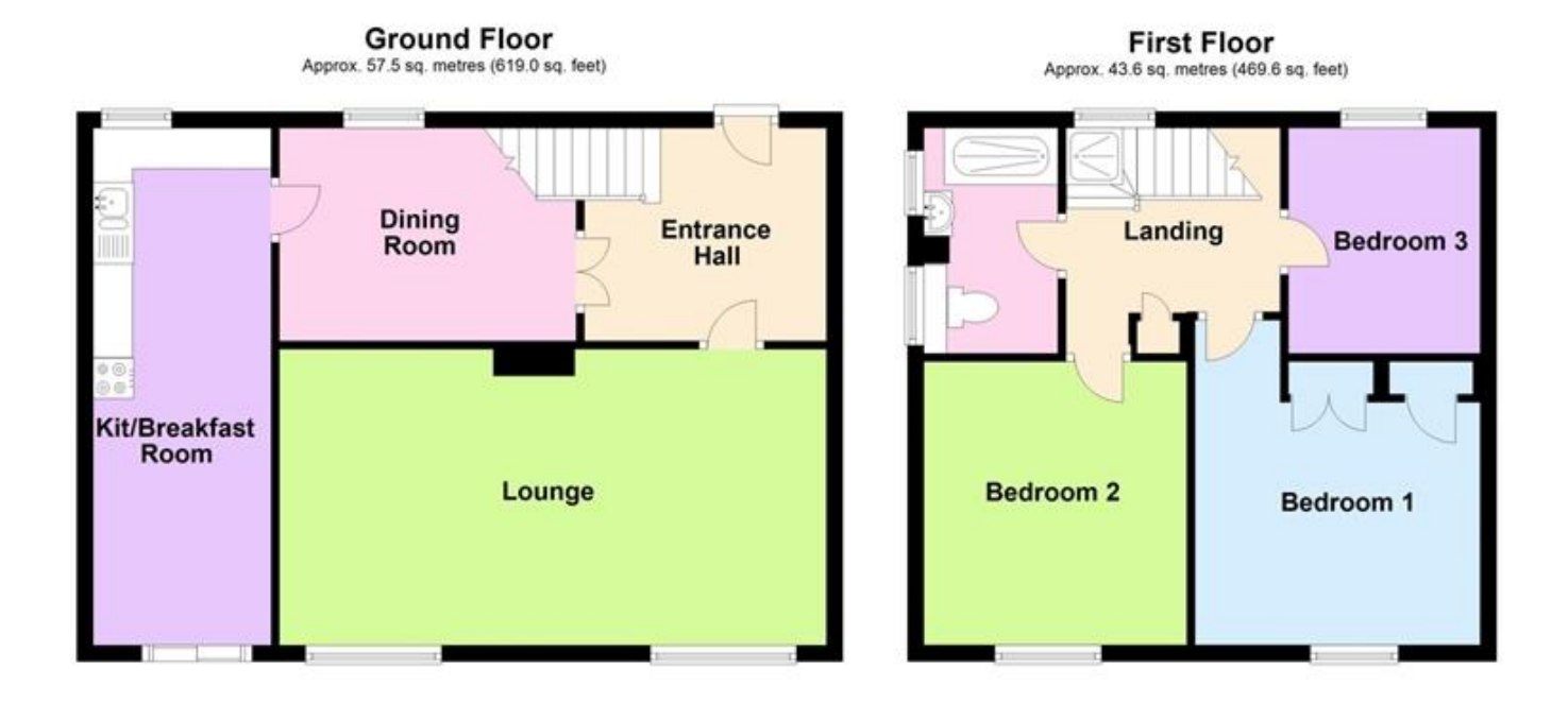
Total area: approx. 101.1 sq. metres (1088.6 sq. feet)