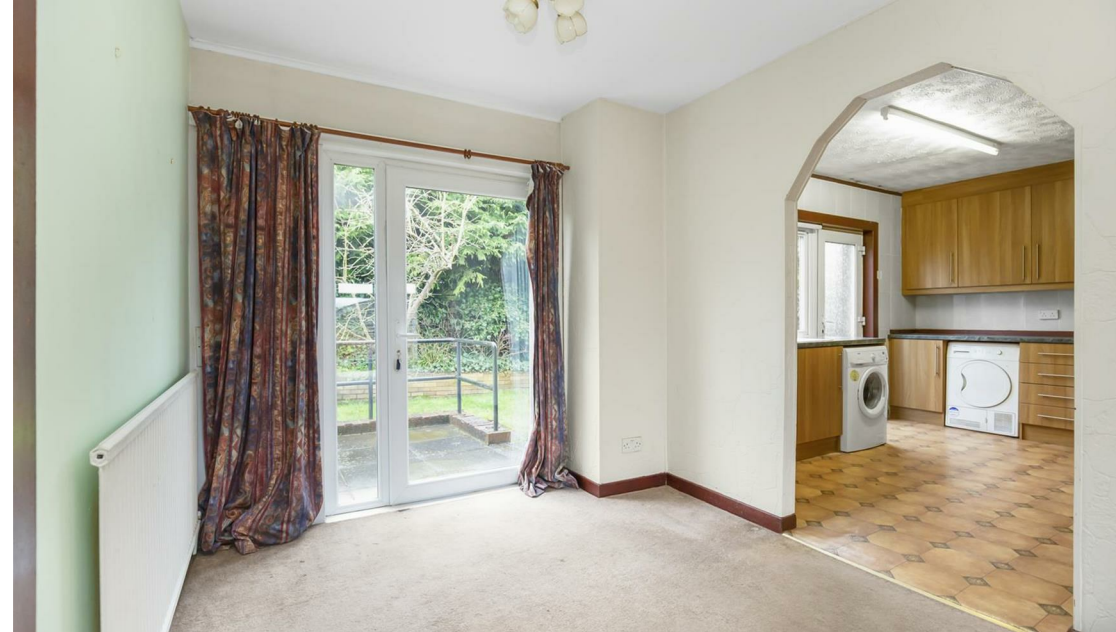
Early entry available. Quietly tucked away off the Main Street is this generous detached bungalow circa 1960's with driveway for several vehicles leading to single car garage. The gardens are private with seating and patio areas. The subjects require some upgrading and briefly comprise entrance hall, lounge/dining area, breakfasting kitchen, four bedrooms, one of which could be used as an office/study and wet room. Large attic. The property is double glazed with gas central heating.