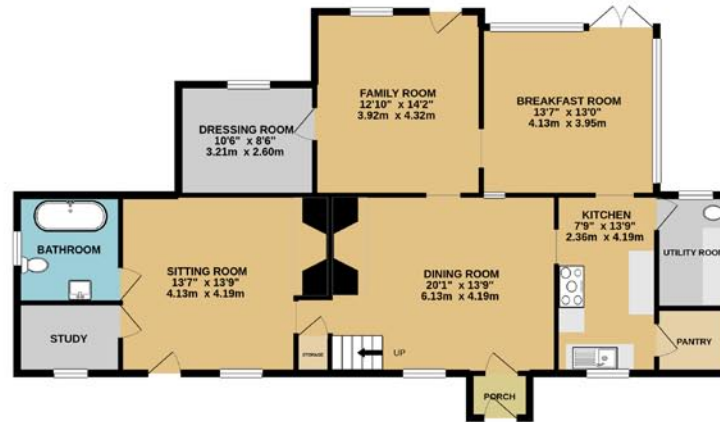
GROUND FLOOR 1183 sq.ft. (109.9 sq.m.) approx.