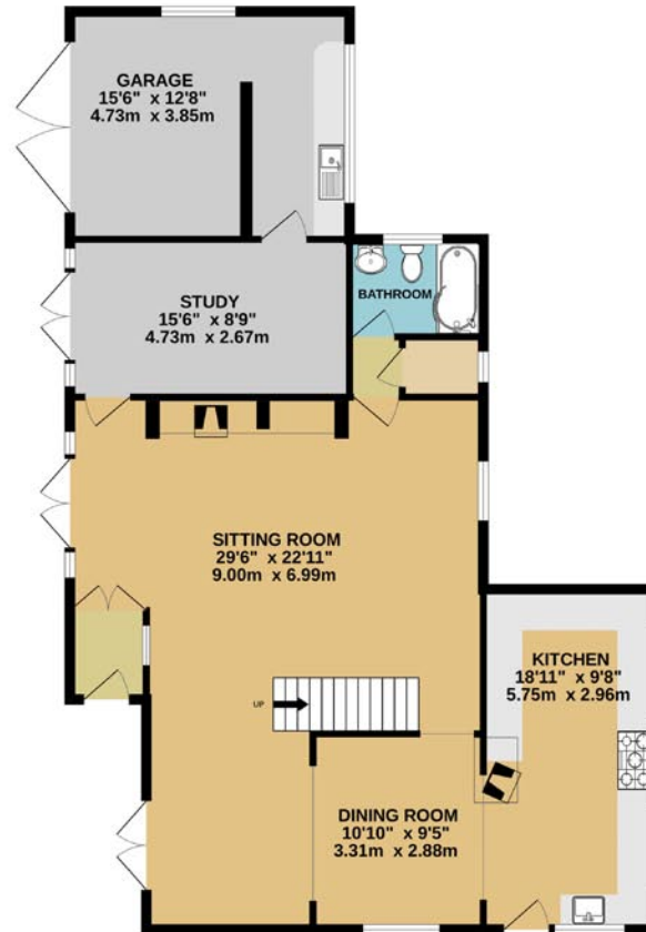
GROUND FLOOR 1187 sq.ft. (110.2 sq.m.) approx.