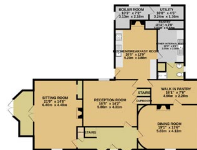
TOTAL FLOOR AREA: 3421 sq.ft. (317.8 sq.m.) approx.

While every attempt has been made to ensure the accuracy of the floor plan contained here, measurements of doors, windows, rooms and any other items are approximate and no responsibility is taken for any error, omission or mis-statement. This plan is for illustrative purposes only and should be used as such by any prospective purchaser. The services, systems and appliances shown here have not been tested and no guarantee as to their operability or efficiency can be given. Made with Version 12/02