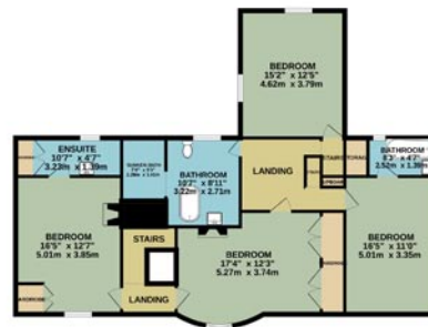
1ST FLOOR 1214 sq.ft. (112.8 sq.m.) approx.