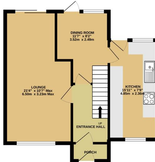
GROUND FLOOR 484 sq.ft. (44.9 sq.m.) approx.