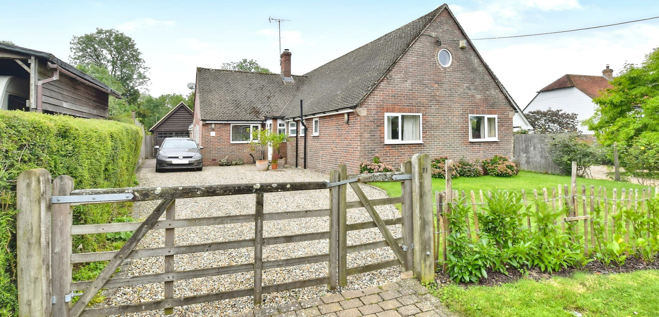
'Little Meads' 31 Swan Street, Wittersham, Kent TN30 7PH Guide Price £650,000 Freehold