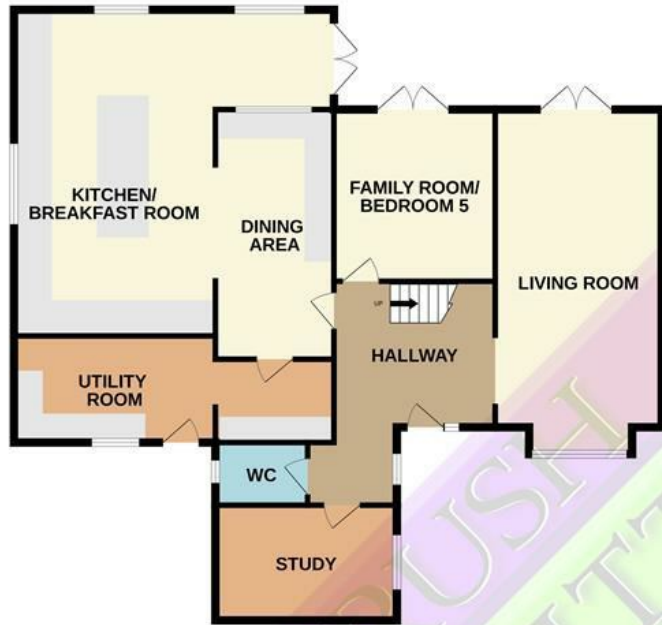
GROUND FLOOR 1544 sq.ft. (143.4 sq.m.) approx.