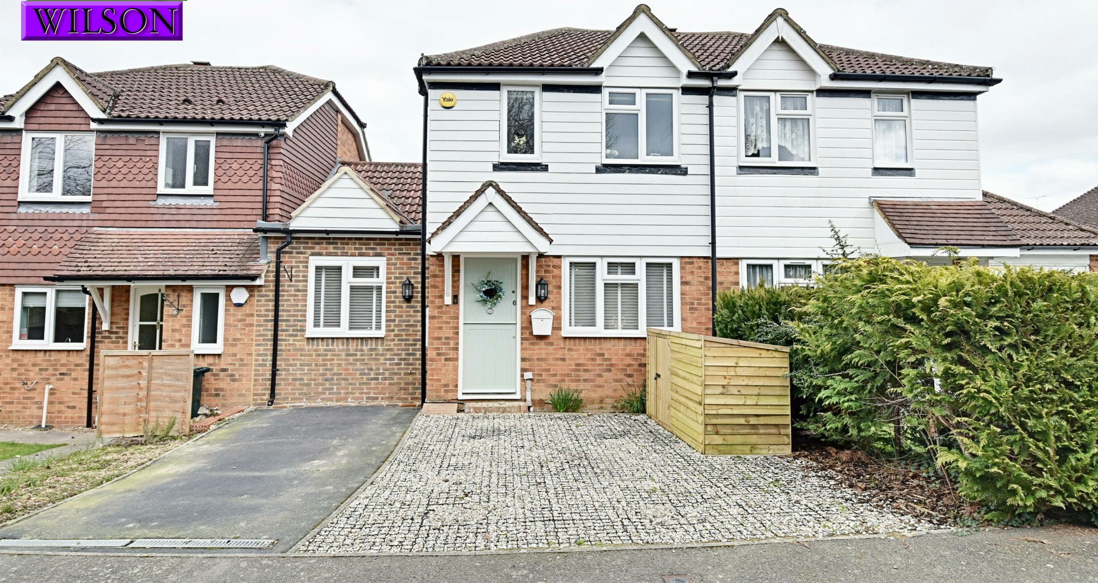
6 Mansion House Close, Biddenden, Kent TN27 8DE Offers in the region of £349,950