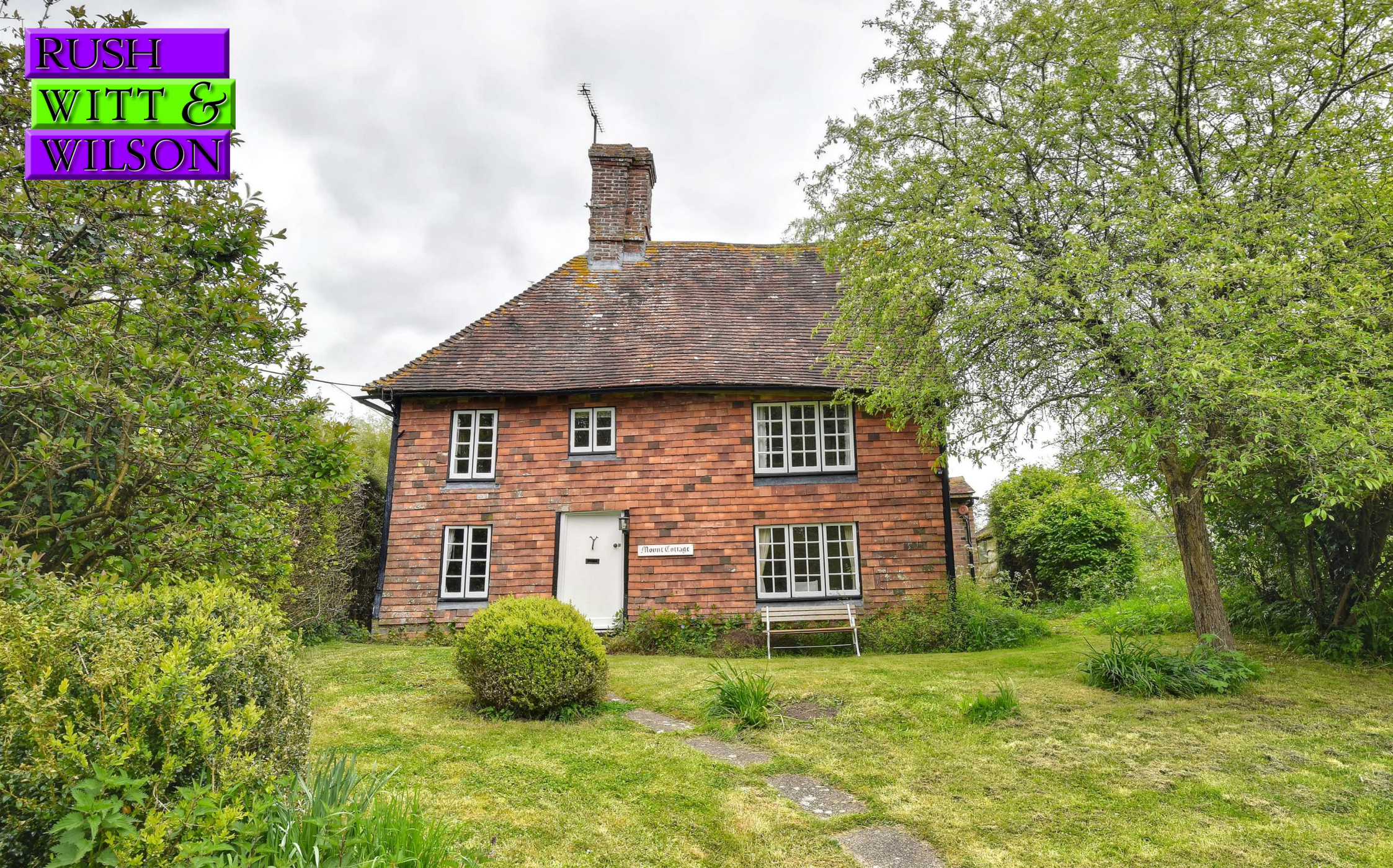
Mount Cottage Mounts Lane, Rolvenden Layne, Kent TN17 4NU Guide Price £550,000