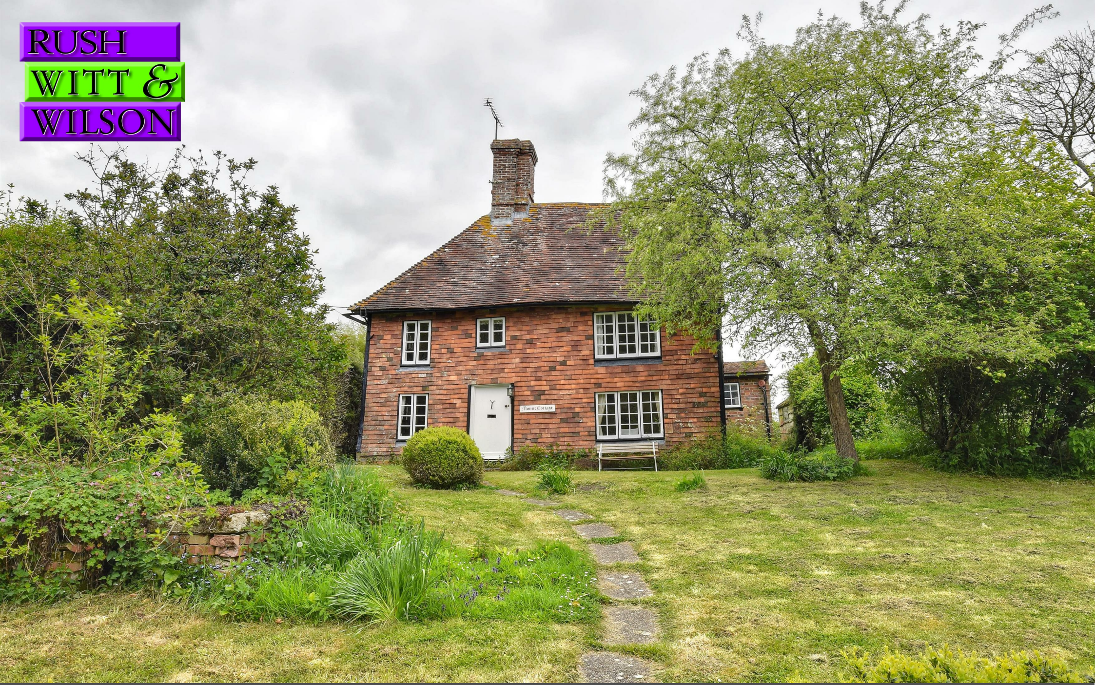
Mount Cottage Mounts Lane, Rolvenden Layne, Kent TN17 4NU Guide Price £600,000