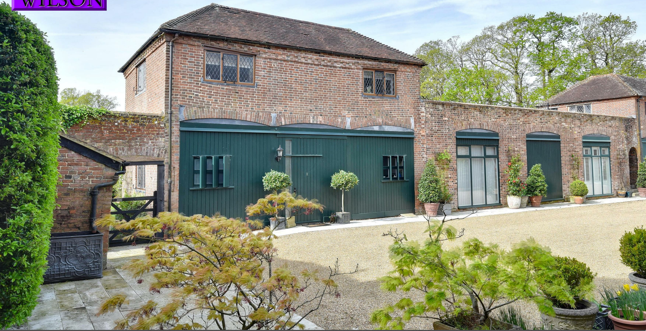
1 Coach House Mews Great Maytham Hall, Rolvenden, Kent TN17 4NE Offers In The Region Of £745,000