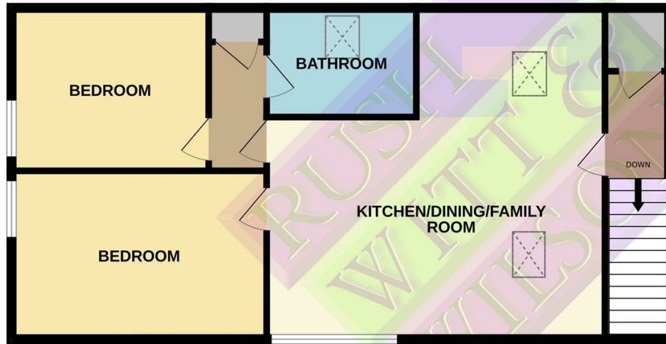
FIRST FLOOR 757 sq.ft. (70.3 sq.m.) approx.