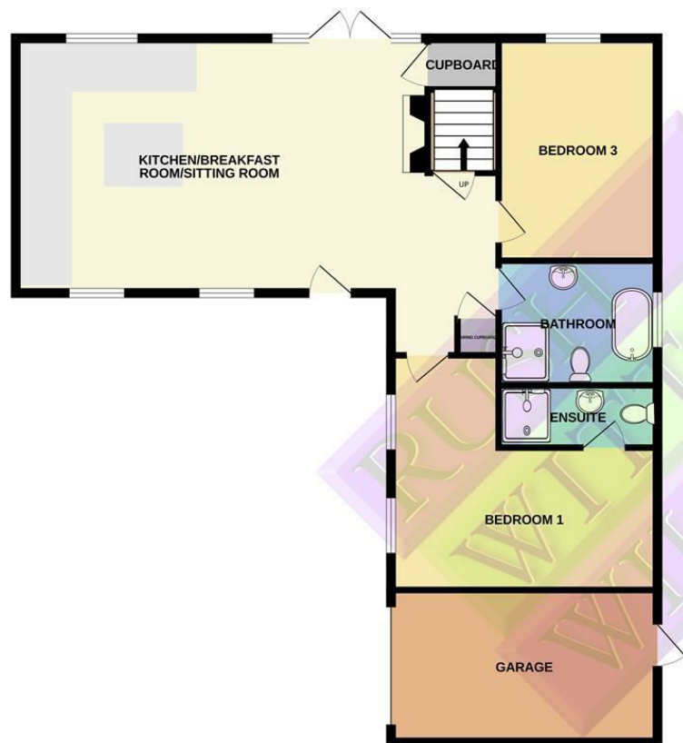
GROUND FLOOR 1019 sq.ft. (94.6 sq.m.) approx.