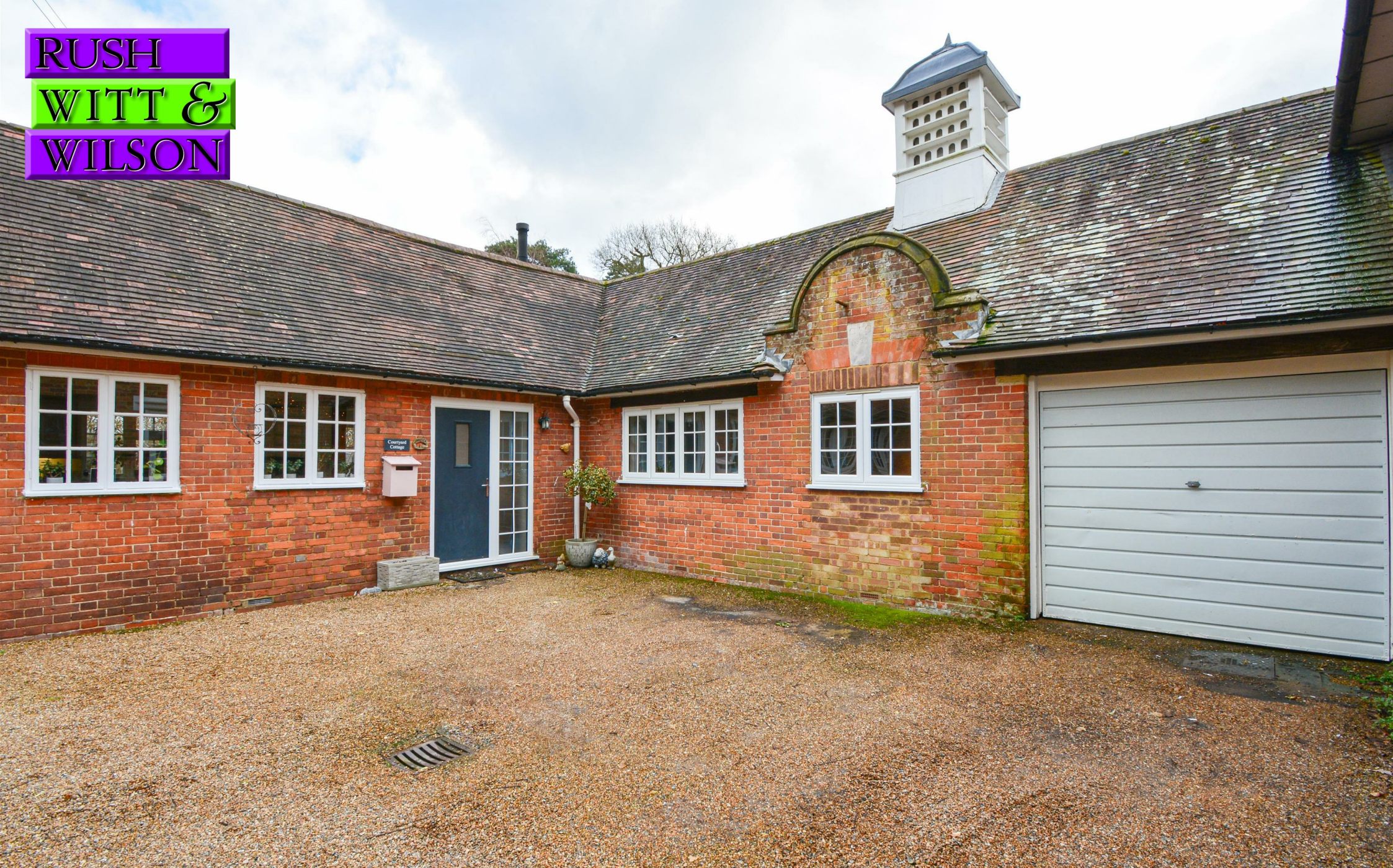
Boarzell Courtyard Cottage, London Road, Hurst Green, East Sussex TN19 7QY £450,000