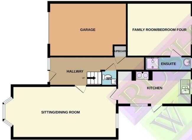
GROUND FLOOR 940 sq.ft. (87.3 sq.m.) approx.