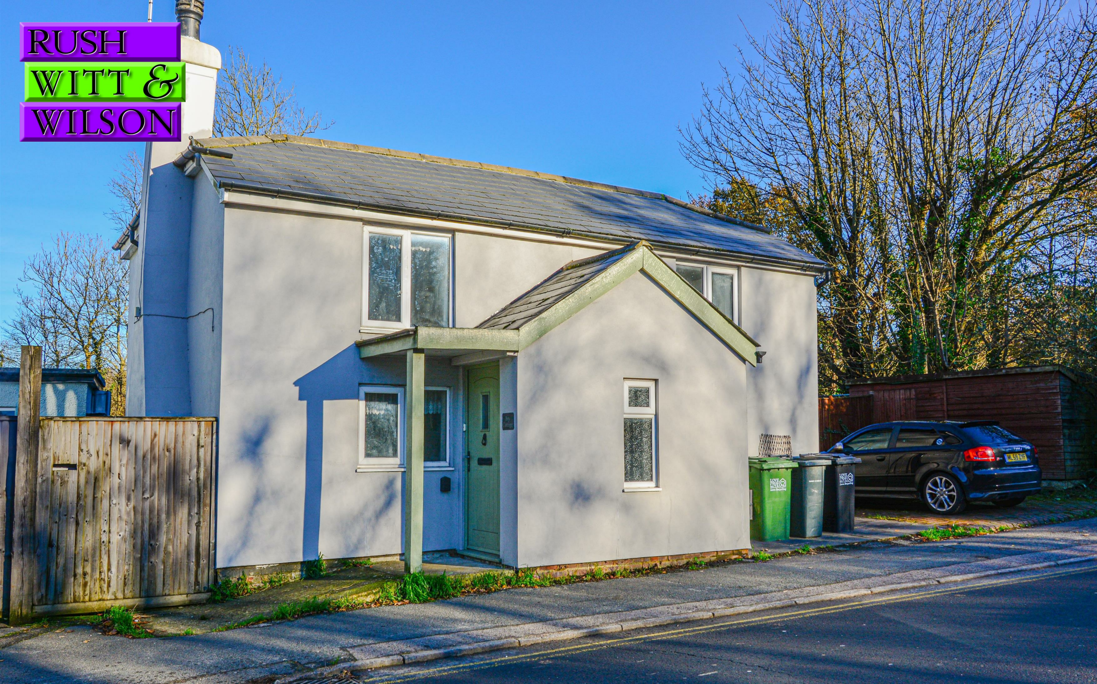
Ivy Cottage, Battle Hill, Battle, East Sussex TN33 0DA By Auction £290,000