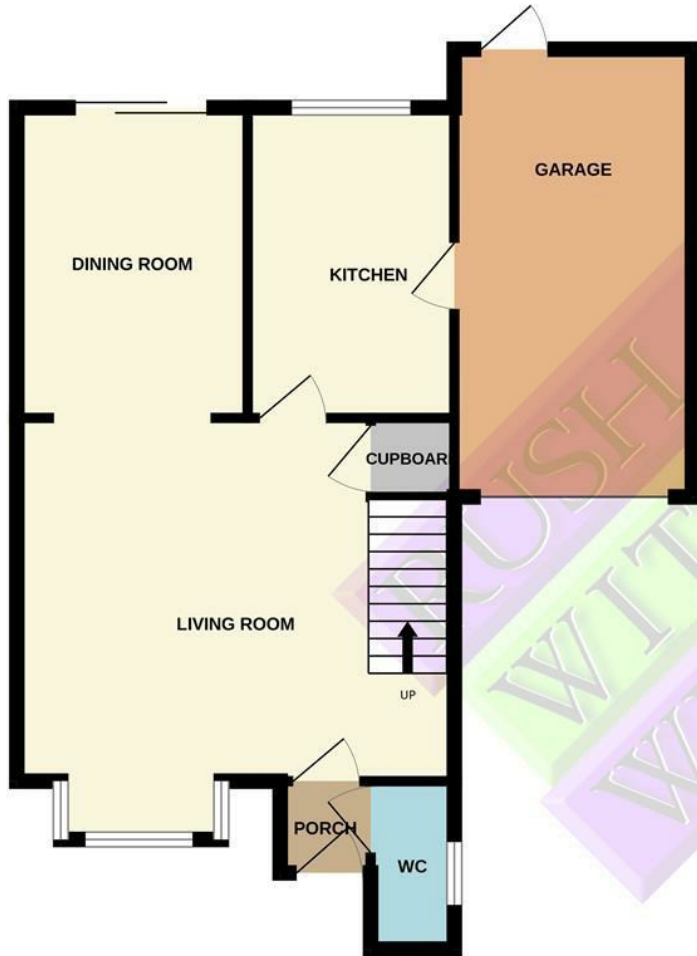
GROUND FLOOR 617 sq.ft. (57.3 sq.m.) approx.