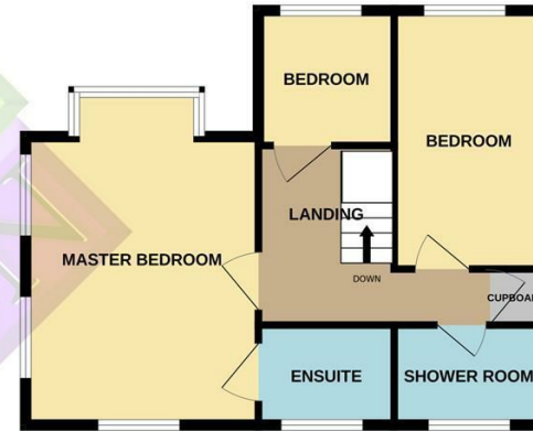
1ST FLOOR 506 sq.ft. (47.0 sq.m.) approx.