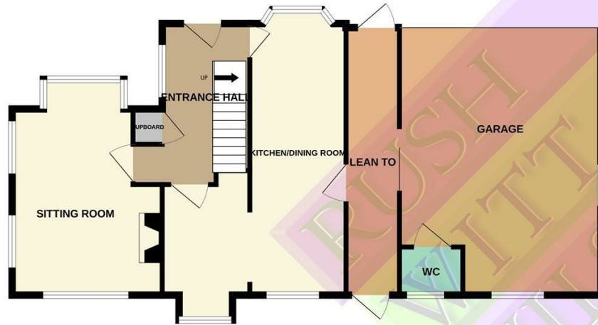
GROUND FLOOR 953 sq.ft. (88.5 sq.m.) approx.