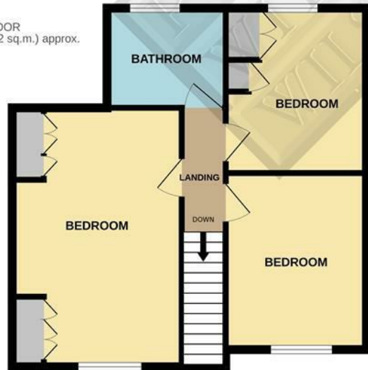
TOTAL FLOOR AREA : 1278 sq.ft. (118.7 sq.m.) approx.

Whilst every attempt has been made to ensure the accuracy of the floorplan contained here, measurements of doors, windows, rooms and any other items are approximate and no responsibility is taken for any error, omission or mis-statement. This plan is for illustrative purposes only and should be used as such by any prospective purchaser. The services, systems and appliances shown have not been tested and no guarantee as to their operability or efficiency can be given. Made with Metropix ©2024