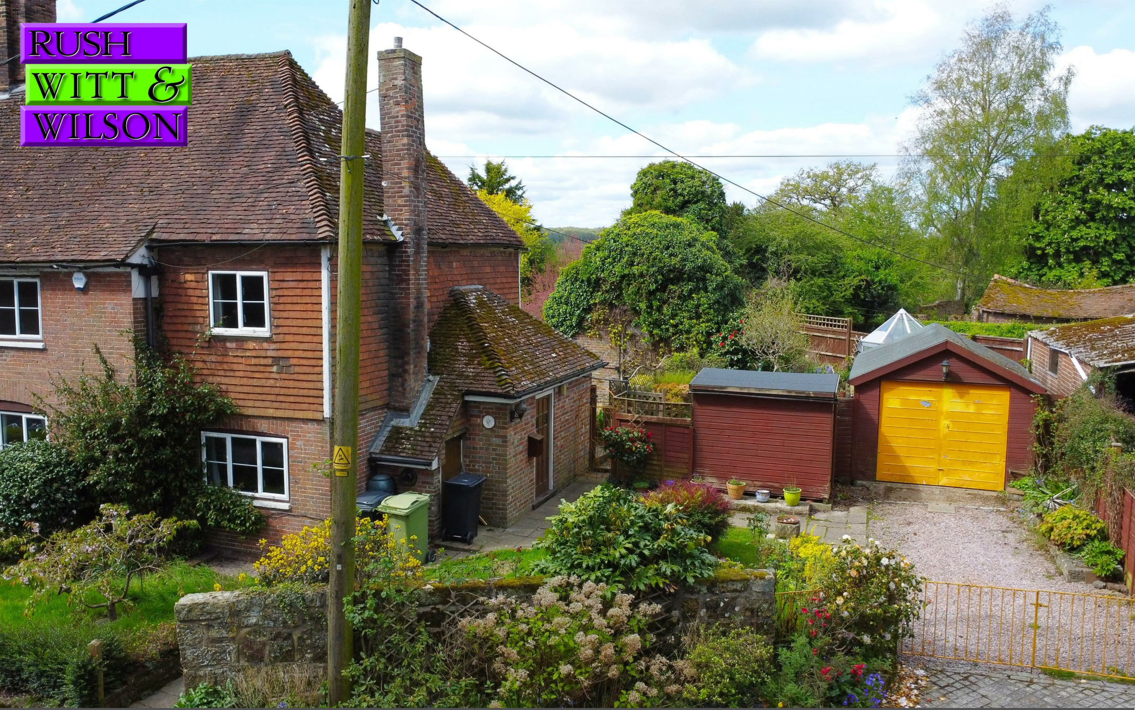
Church Farm Cottage Church Lane, Robertsbridge, TN32 5PJ £525,000