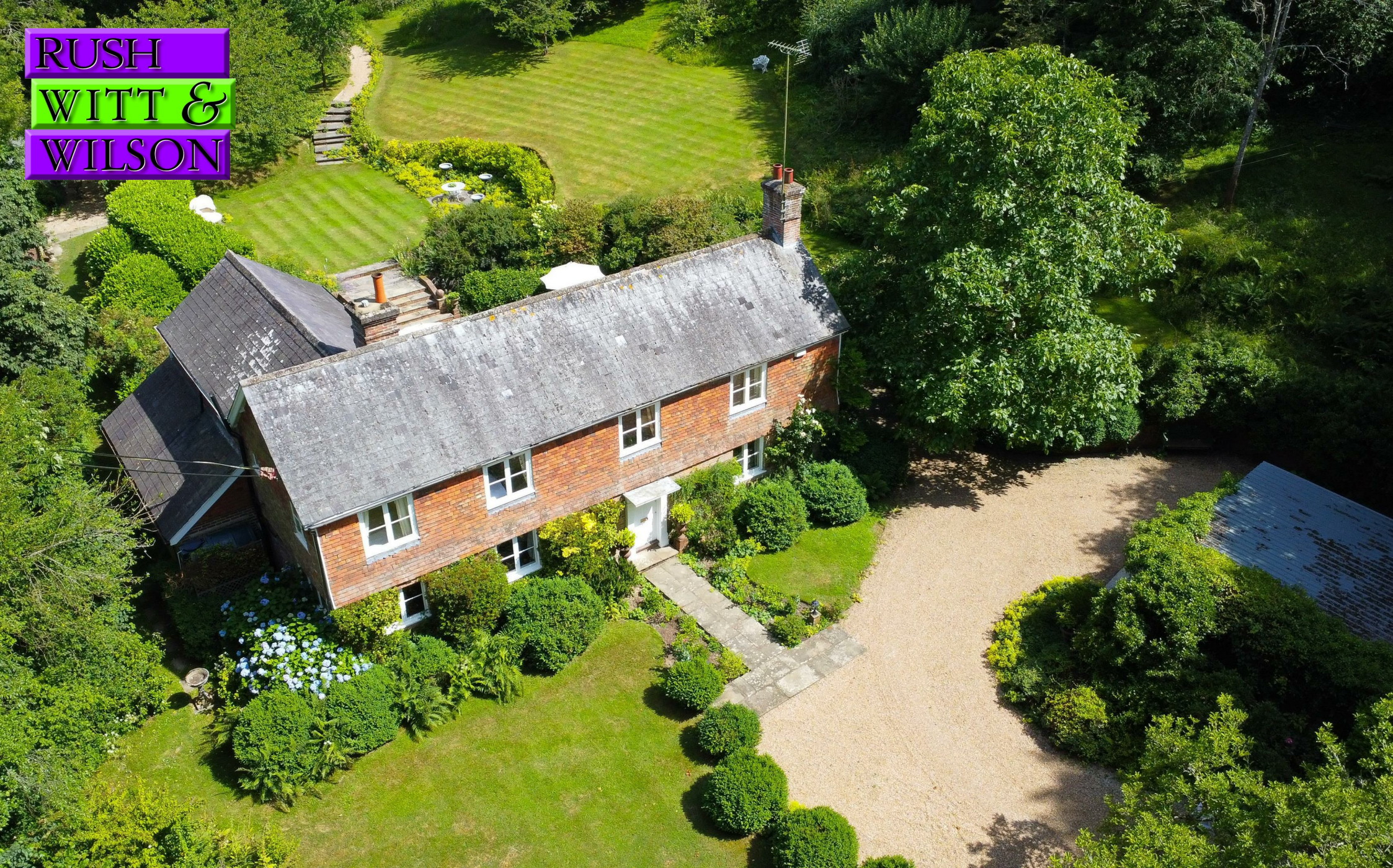
Bourne Farmhouse, Bourne Lane, Robertsbridge, East Sussex TN32 5PT £1,625,000